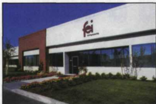
Fujichrome Astia 100

Over the past few years, Fuji Photo has introduced a variety of high quality films for both the professional and amateur market. Sensia, Provia and Velvia all con-