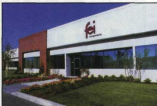
Fujichrome Velvia 50

Above is a film recorder comparison of Astia and Velvia. You be the judge.